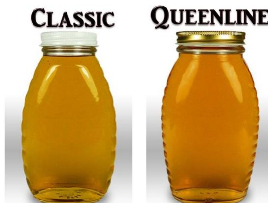
Correct jars for extracted honey.

The correct fill level on honey entries is at the top of the fill ring of the jar, without going over. The fill ring is the raised ridge, or ring of glass, immediately above the shoulder of the jar and below the threads. It can be distinguished from the threads in two ways: a) the fill ring forms a complete circle, without ends; and b) the fill ring will be completely parallel with the bottom and top of the jar. Liquid honey in a circular shape forms a concave surface sometimes referred to as a meniscus. For the purpose of filling jars, the edge of the meniscus should clearly be at the top of the fill ring, without going over.